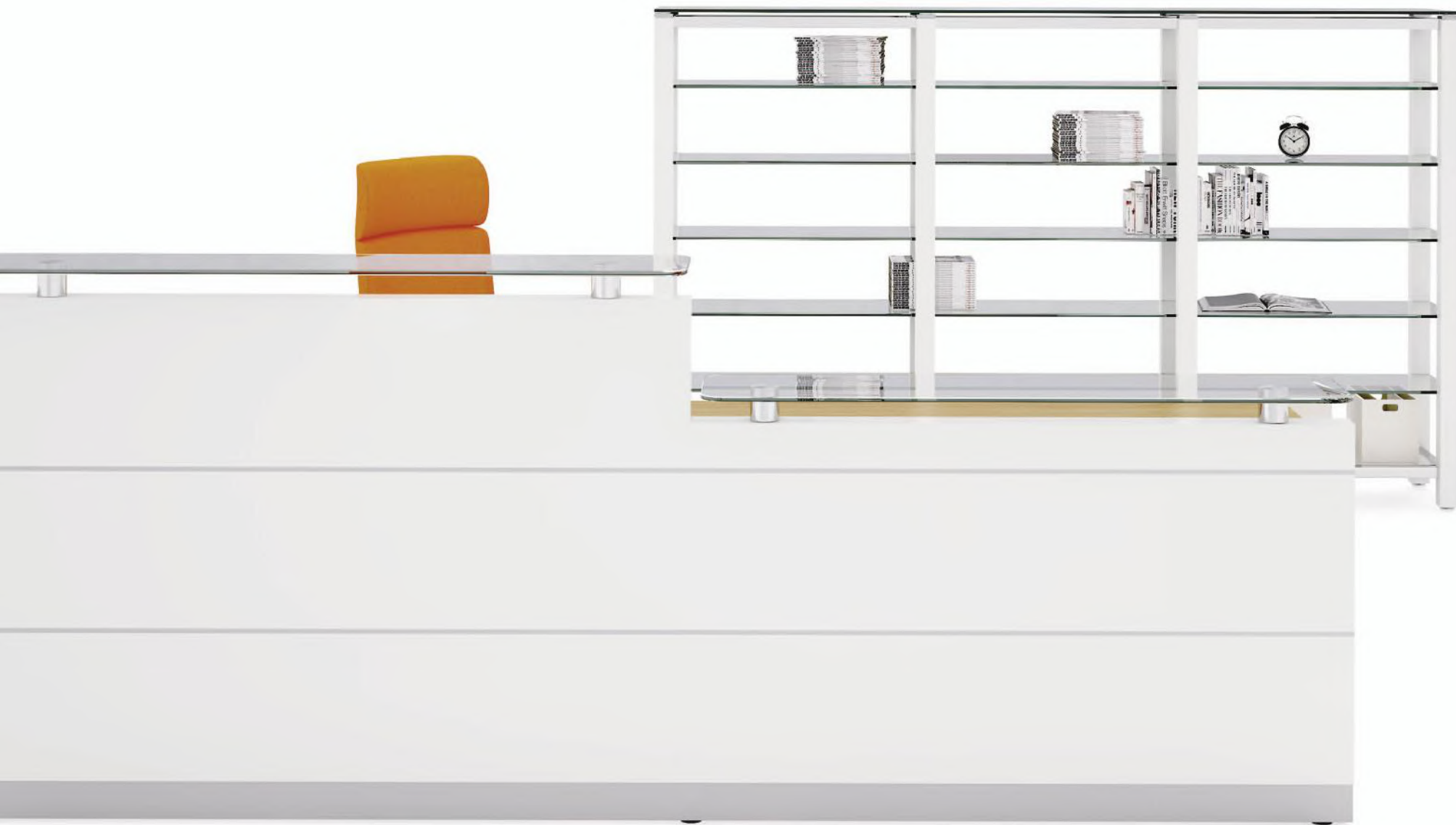
Scene desk in polar white laminate with oak desk top. Shown with Oxford glass display unit.