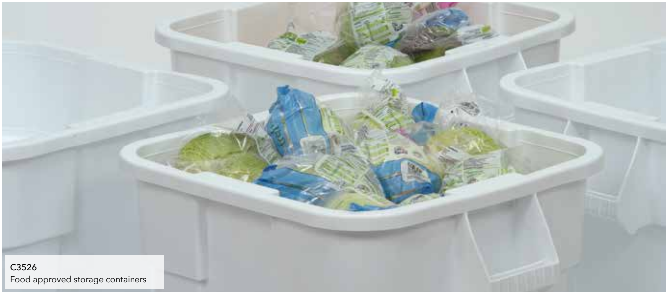
C3526 Food approved storage containers