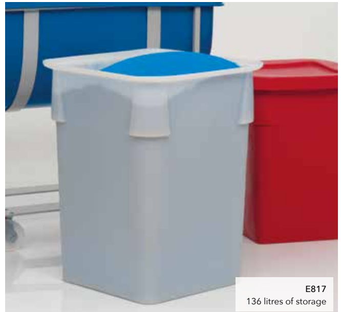
E817 136 litres of storage