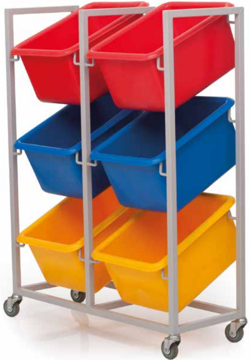
X338 x 6 CONTAINER FRAME - MOBILE