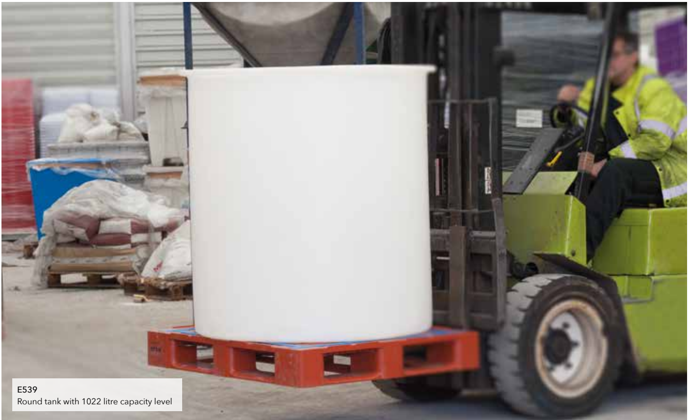
E539 Round tank with 1022 litre capacity level