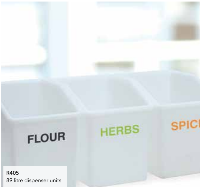
R405 89 litre dispenser units