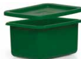
X8338 & X338