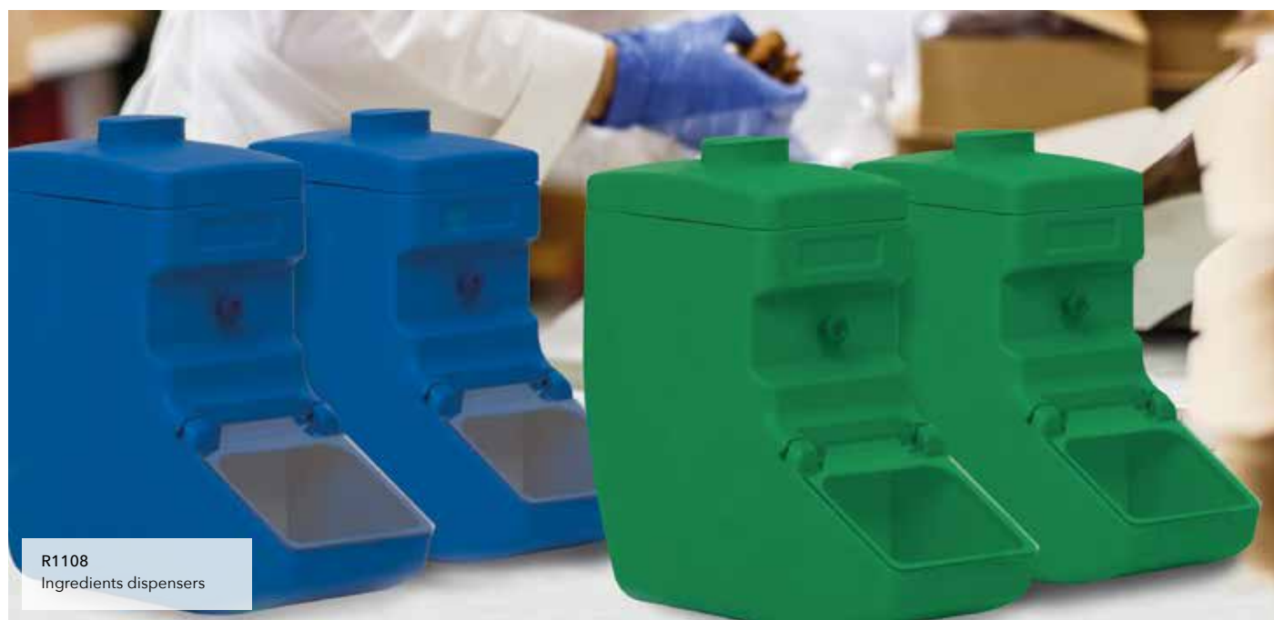
R1108 Ingredients dispensers