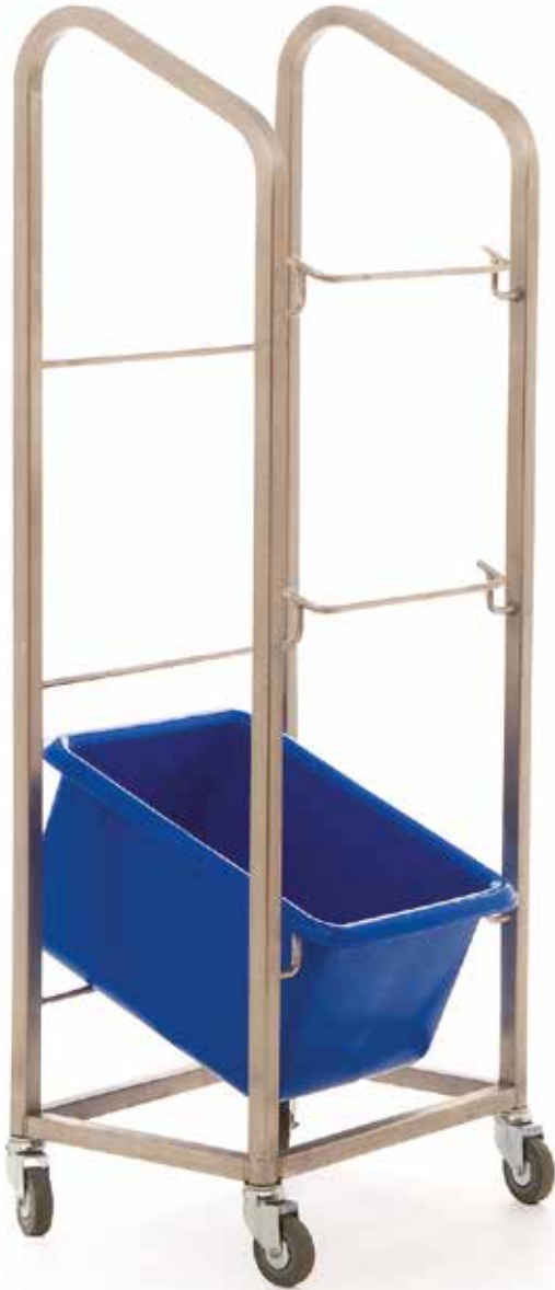
H3338Ss x 3 CONTAINER FRAME - MOBILE