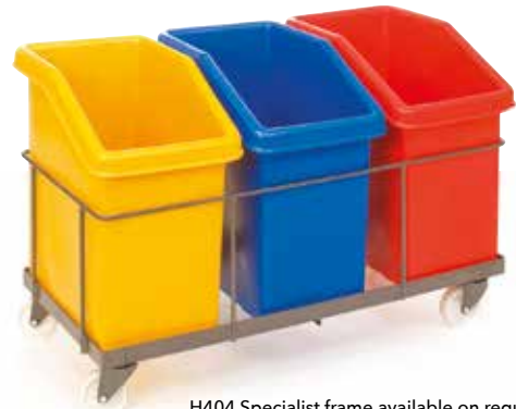
H404 Specialist frame available on request