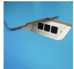
Power socket housing (contact us for details).