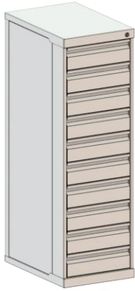
430mm WIDE CABINET