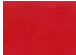
Red (Pan 1797C)