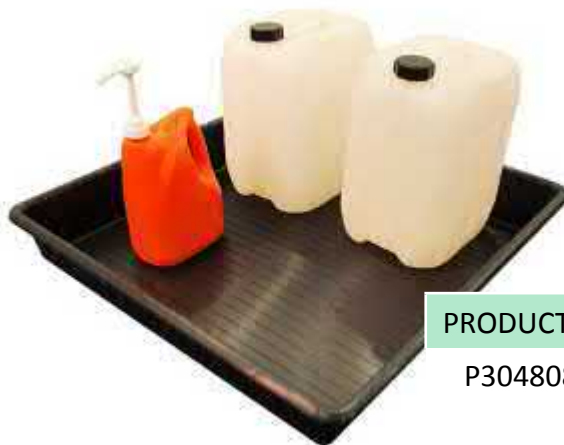
PRODUCT No P3048080