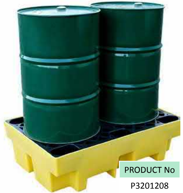
PRODUCT No P3201208