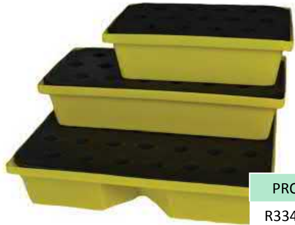
PRODUCT No R3340604 (20L) R3340603 (30L) R3340806 (40L)