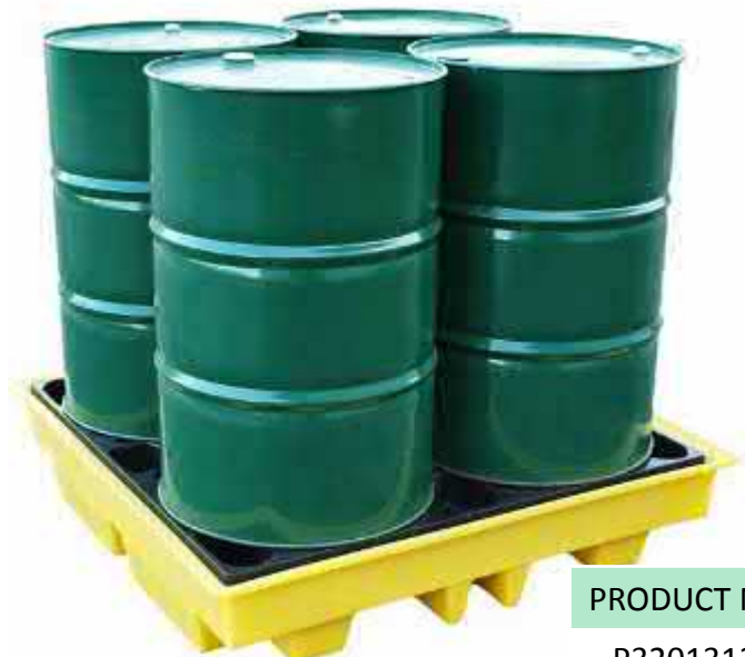
PRODUCT No P3201312