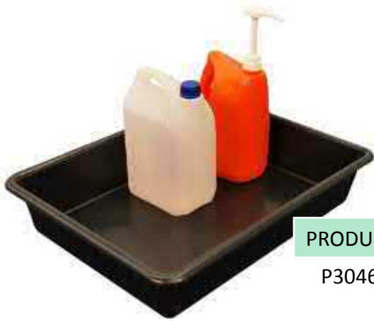
PRODUCT No P3046549