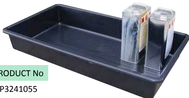
PRODUCT No P3241055