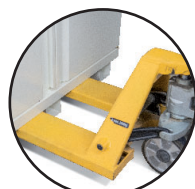
Moving by pallet truck (empty)