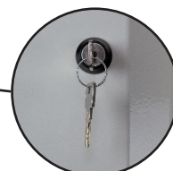
Key locking System