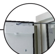
Self-closing door(s) with thermo-fuse